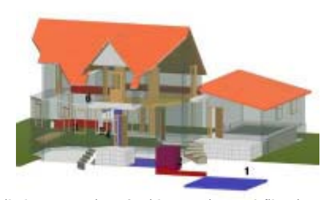
Fig.2. Family house equipped with experimental filtration system; Isometric diagram of filtration and ventilation