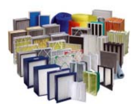
Fig. 1. Pleated Panel HVAC Air Filters and HEPA Filters

classic means exhaust ventilation (exhaust foul air) and input (fresh air).